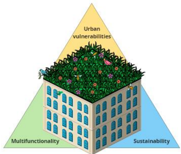
Figure 2. Integrated assessment of green roofs based on the dimensions of Vulnerability, Multifunctionality and Sustainability. Adapted diagram from (Langemeyer et al., 2021)

Sustainability: ability to preserve the functionality of the infrastructure over time without compromising natural resources and biological ecosystems, while maintaining and promoting a good standard of living within society.